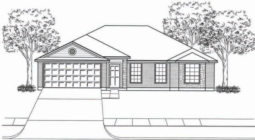
FRONT ELEVATION "A" LEM-1698EV