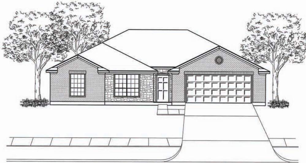
FRONT ELEVATION "A" LEM-1707EV