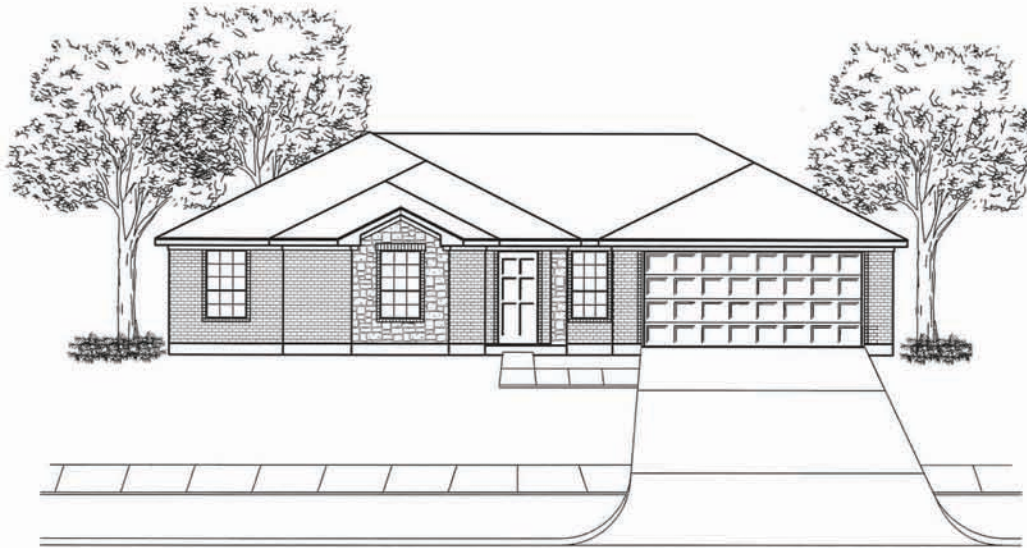
ELEVATION "A" LEM-1618EV